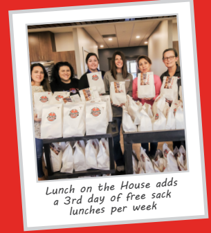
Lunch on the House adds a 3rd day of free sack lunches per week