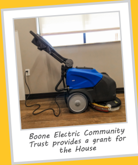
Boone Electric Community Trust provides a grant for the House

Thanks to Boone Electric Community Trust for a grant to purchase a floor scrubber for the House! Your support helps us keep the House clean and welcoming for families.