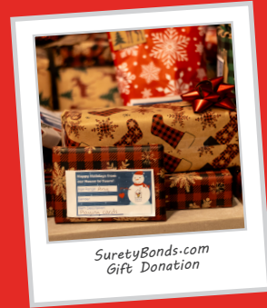
SuretyBonds.com Gift Donation

With the help of our volunteers, Lunch on the House is now delivered to families in the hospital every Monday, Wednesday, and Friday.